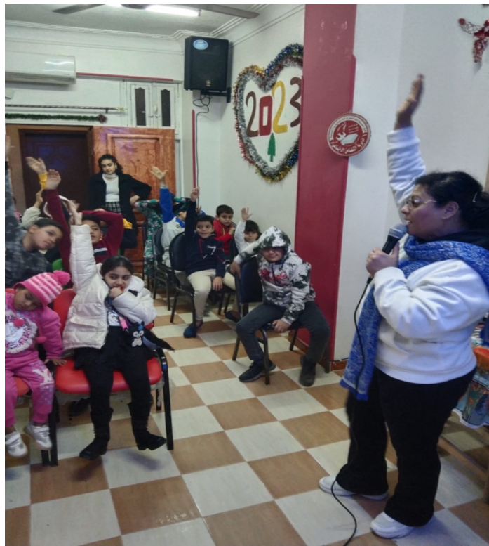
Volunteers helping to lead the Children's Ministry in Egypt.

The second focus is a girl's ministry that serves 25 girls. The goal for this ministry is for the participating girls to know Jesus as a friend, Savior, and Redeemer and that they can rely on the Lord always. In this group setting, young girls are brought together and given space to just be themselves and to play. Unlike the boys in their community, they do not have a place in public where they are able to do this. This ministry also seeks to take the participants on short day trips and to do other fun activities with them as they also learn the Bible and skills such as cooking and handicrafts.