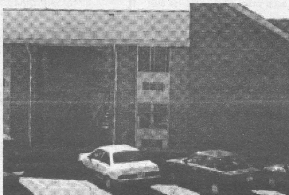
Redford Apartments will have an addition of two RAs next year.