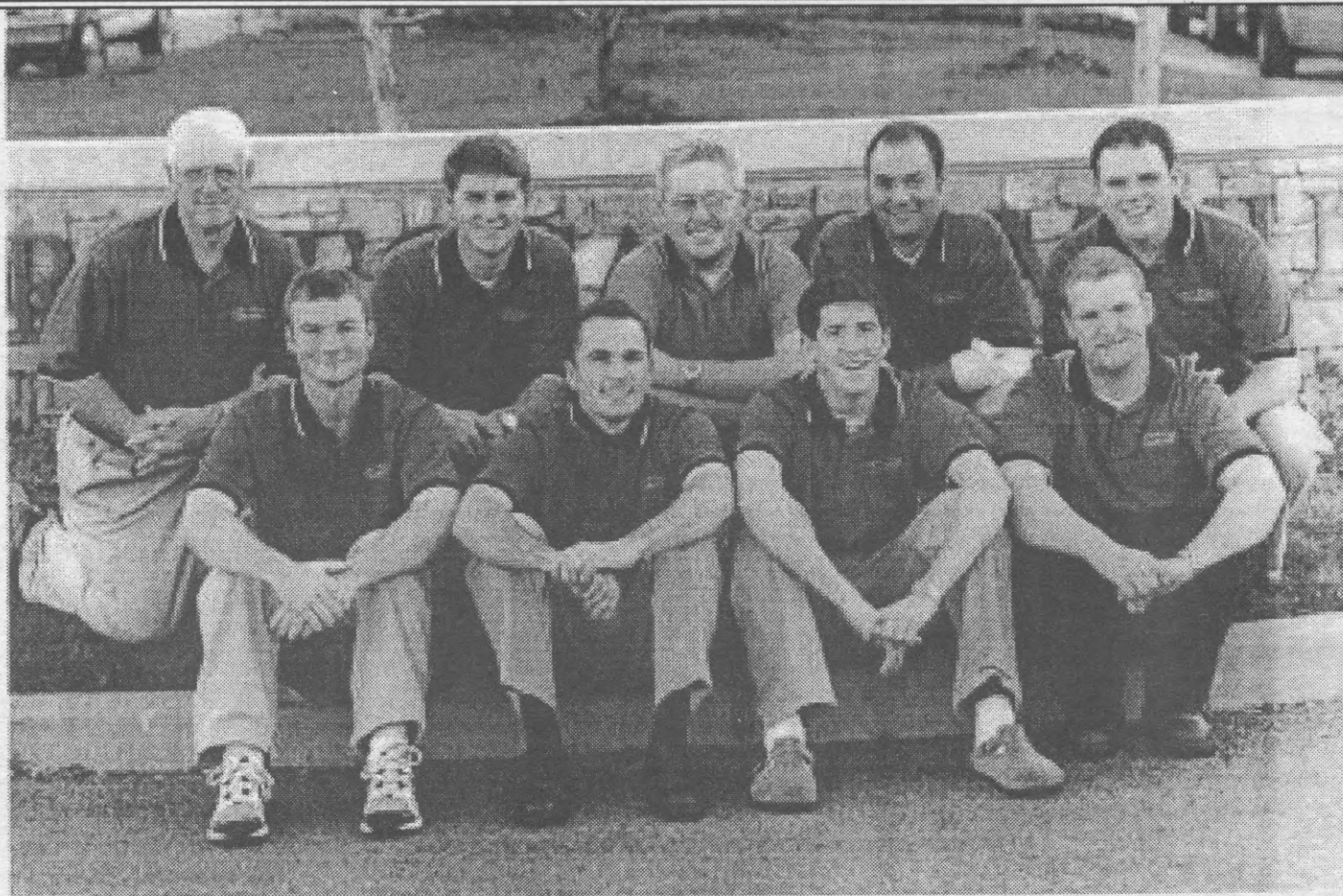
2001-2002 Men's Golf Team

The girls looked great on Friday and should continue to play well together throughout the season.