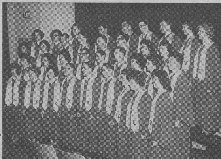
A Capella Choir